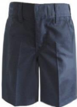
Boy's Uniform style shorts

Uniform style flat or pleated pants and Capri pants. Solid colors only: Navy Blue and Khaki 9 th – 12 th grade can wear Black