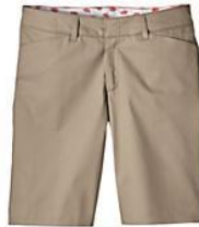
Girl's Uniform style shorts

Solid colors only: Navy Blue and Khaki. 9 th – 12 th grade can wear Black